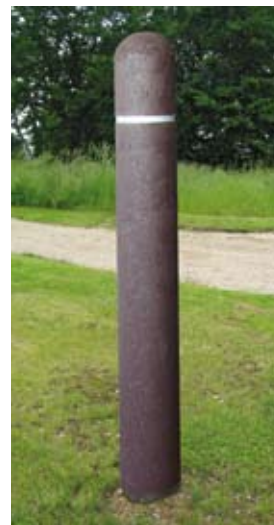
▲ ABERDEEN CIRCULAR with reflective white tape