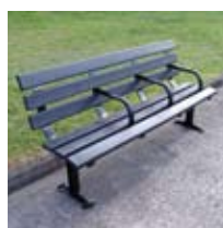
recycled plastic slats pg 164