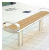
recycled composite slats pg 165