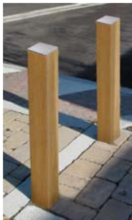
► GLASGOW FLAT with stainless steel cap

Funitubes recycled composite timber bollards are made from 100% recycled material. Made from 50% sawdust & 50% HDPE, the product maintains a natural wood texture and appearance at a reduced environmental and economic cost.