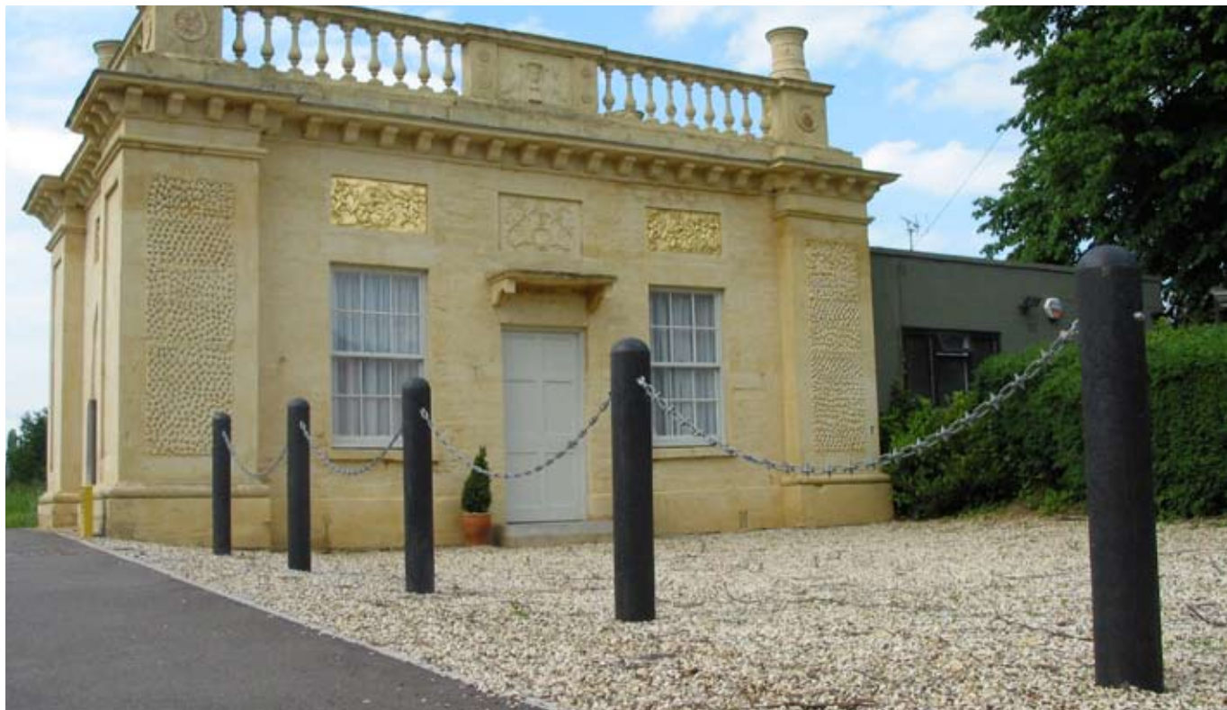
▲ ABERDEEN CIRCULAR with chain (special commission) shown here at The National Trust, Buckingham