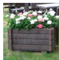
recycled plastic planters pg 320