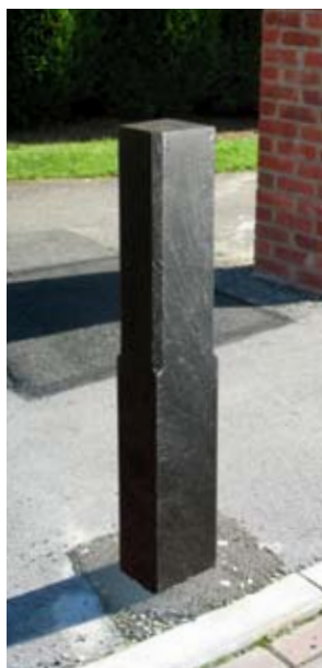
▲ ABERDEEN SQUARE