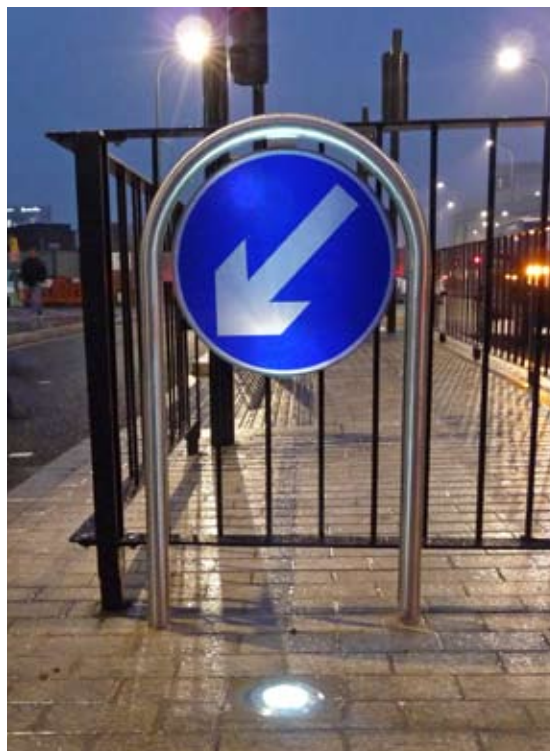
▲ LED 150 shown with the DISTRICT Traffic Bollard (see page 35) installed at Shepherds Bush, London

In addition to illuminated display cases, Furnitubes also supply LED uplighters which can be used to light up many of our products, from bollards and litter bins to seats. Available in three sizes with an array of options, including materials and light colour.