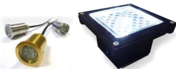
▲ LED 035 options shown: ■ stainless steel flat edge (left) ■ brass body flat edge (centre) ■ stainless steel bevel edge (right)