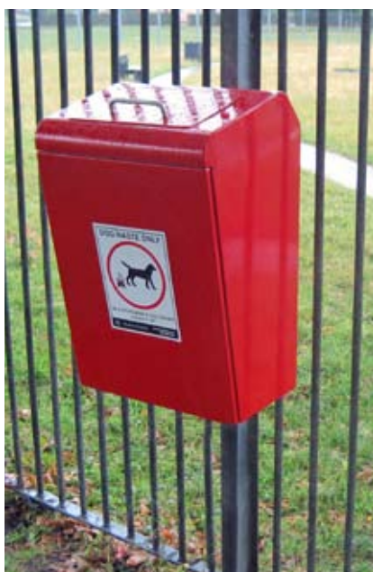
▲ LUCKY Post Mounted shown in Ramsgate, Kent