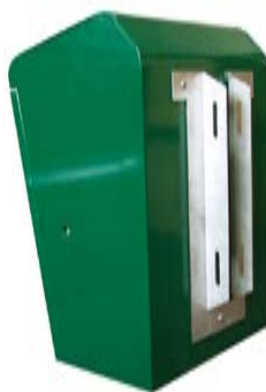
▲ LUCKY Post Mounted optional brackets to suit post mounting with banding