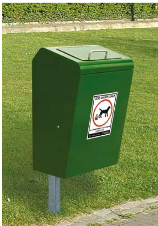
▲ LUCKY Root Mounted stocked in Red and Green as standard as supplied to Berkeley Homes, Marlow, Buckingham

Based on customer research, Furnitubes are proud to now offer the Lucky all-steel dog waste bin. The galvanised construction minimises fire damage and is extremely durable.