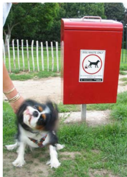
▲ LUCKY Root Mounted (and Snuffles)

The handle and hinge are stainless steel and the hygienic easy-lift double lid with integral metal chute conceals the bins' contents whilst opening. The galvanised liner is removable to allow regular cleaning and the quick-release slam-lock makes emptying more convenient.