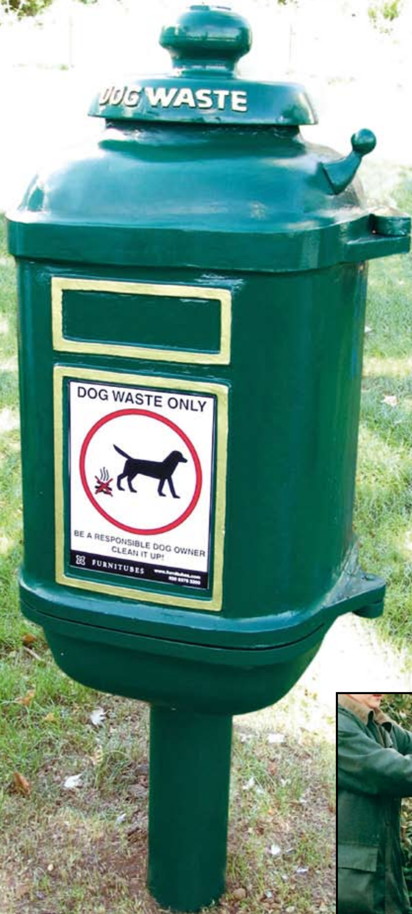
▼ PEDIGREE Dog Waste Bin available in green and red (inset) as supplied to LB Bromley