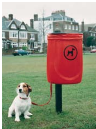
▲ TERRIER (and Eric) shown at Blackheath, London

The Terrier polyethylene dog bin has been manufactured for ease of use by the public and cleansing authority. The dual position lid remains upright for cleaning purposes but is self-closing during normal use. A deodorising block is secured within the lid to neutralise smells.