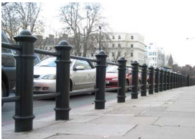
▲ HOLBORN 2-RAIL installed at Bessborough Gardens, Vauxhall, London

Right, a standard Holborn bollard has been adapted to accept two rail posts. This versatility permits a uniform appearance with other items of street furniture and with existing bollards. Standard cast iron bollards can be adapted to act as barriers, railings, fencing and gate posts.