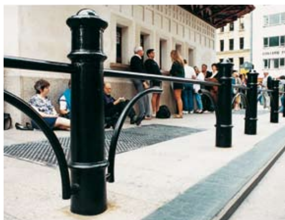
▲ CANNON Bollard as railing post

For the complete range of bollards that complement or can be adapted for post & rail applications please refer to the Bollards section.