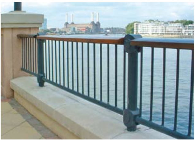
▲ ROMNEY FULL GUARDRAIL with corporate logo (special commission) supplied to St George's Wharf, Vauxhall