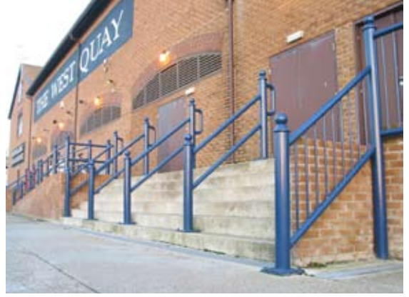
▲ LINX RAILINGS Trafford cap (special commission) supplied to Brighton Marina