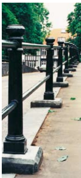
▲ BELSIZE Bollard as railing post

Many of these items are exclusive to Furnitubes International, such as the Belsize whose design was taken from an original Victorian bollard at Belsize Park in Hampstead. Furnitubes' pattern makers skillfully produced a faithful copy which was then cast and adapted to take a circular section rail.