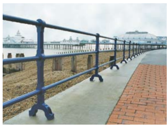
▲ Replica Cast-Aluminium Railings

Furnitubes' design team were sensitive to conservation when asked to extend the existing railings along Eastbourne seafront. The post & rail pictured here is an exact replica of the unusual cast aluminium original.