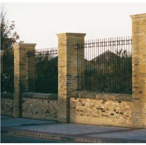
▲ Decorative Steel Railings

While the main function of guardrail is to protect the public from the highway, many systems can be adapted to either incorporate access gates (see page 142) or tailored for wall-top installation, as shown here.