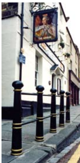
◀ EDINBURGH Bollard as railing post (special commission)