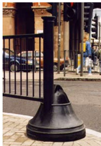
▲ LINX with BELL BOLLARD (see Bollards section)

Railings can also be designed to work in conjunction with many of Furnitubes' products. Here a Linx 100 panel fits seamlessly into a Bell Traffic Bollard. The Bell protects the post from damage and the post provides increased visibility and safety.