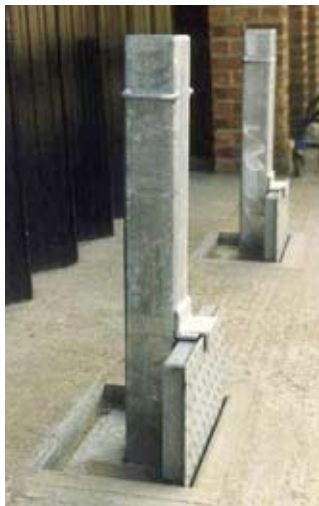
▲ BURR BLOC Removable Steel Security Bollard

Products: Stirling STL 102 SC (see pg 30) & Burr Bloc BBLOC 6 (see page 33) Layout Applies to all Security Bollards.